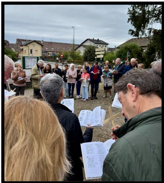
Palm Sunday in Divonne – standing outside at the start of the service – 13 April