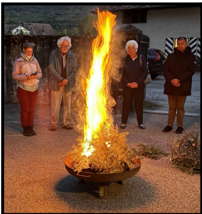
Easter Sunrise Service 20 April 2025