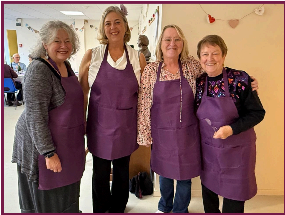
Note the smart branded La Côte Church aprons!