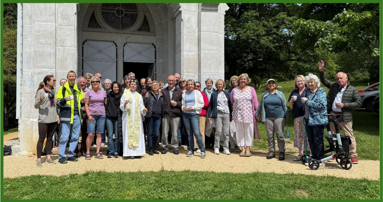
Ascension Day Service high up on the hill, in La Chapelle de Riantmont, Vésancy, France 29.05.26