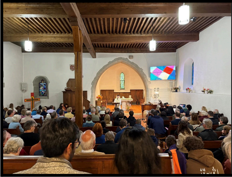
Main Easter Day Celebration 20.04.25