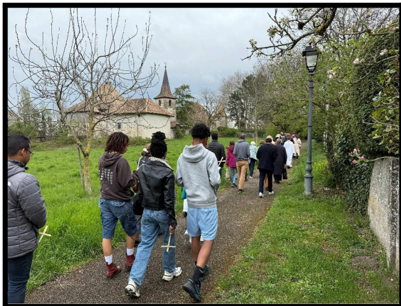
Gingins 13 April – Palm Sunday procession towards the church