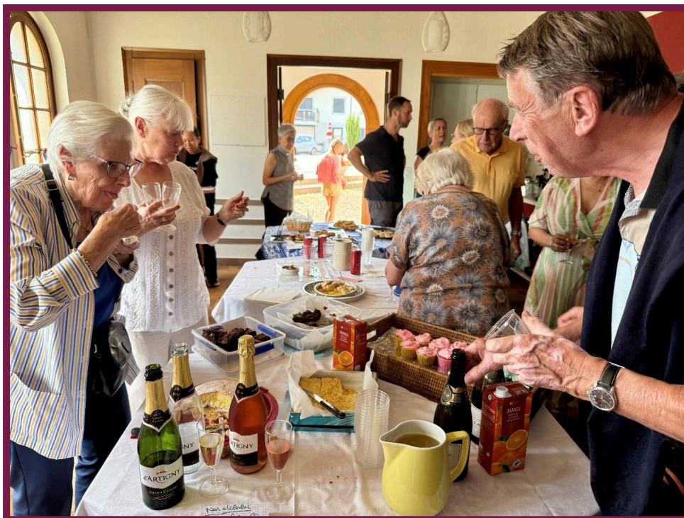
Gift Day Feasting , after a joyful Trinity Sunday service in Crassier, celebrating community life. 15.6.25