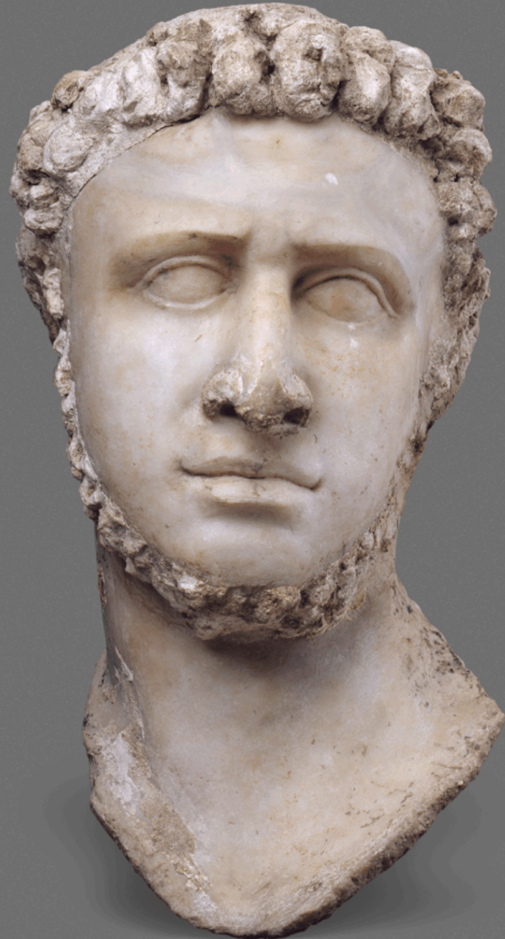
Herod the Great 72 - 4 BC